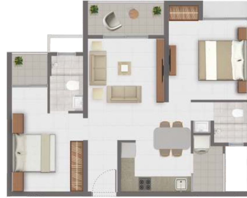
2 BHK - Type 2