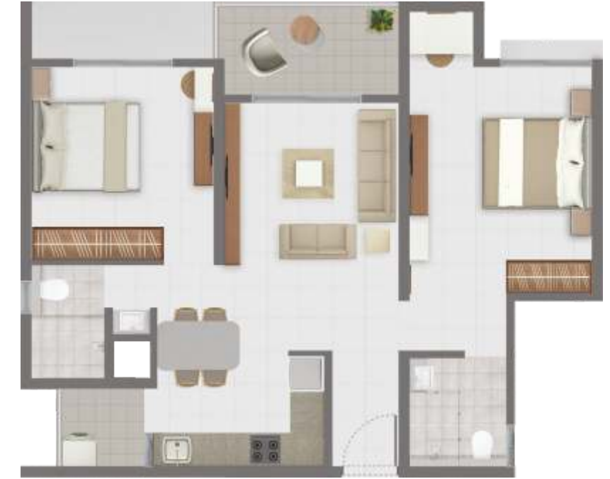
2 BHK - Type 3