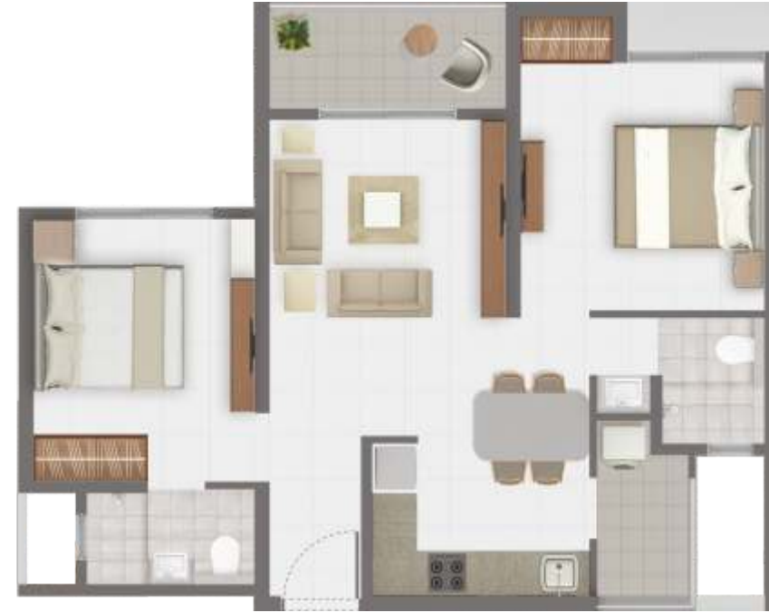
2 BHK - Type 1