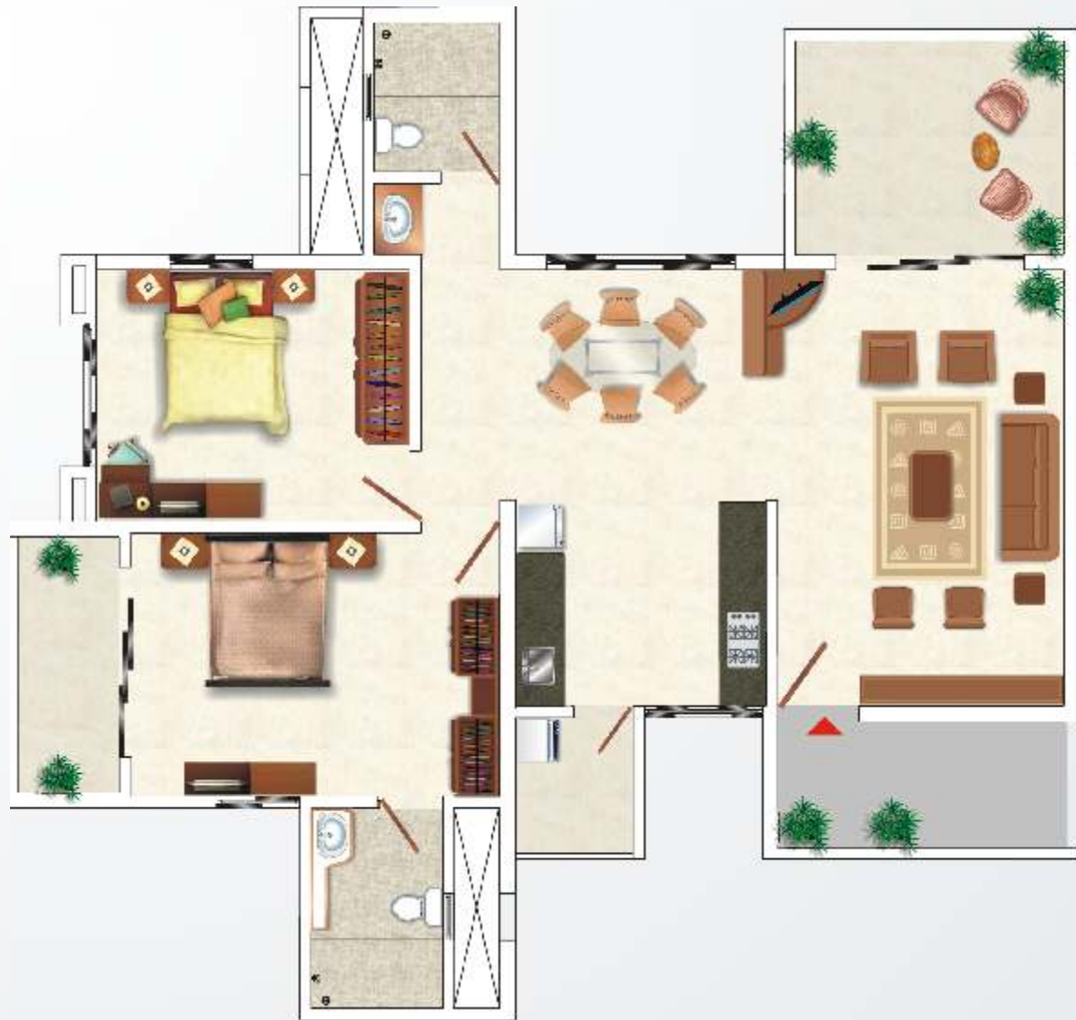
2 Bedroom Flat