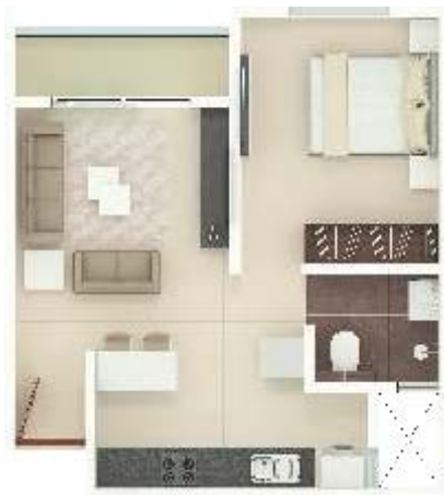
Typical 1 BHK

Our architects draw up every floor plan with you in mind. With little or no wastage of space, ours is an organic design that wraps itself around your needs, making every home a tribute to life.