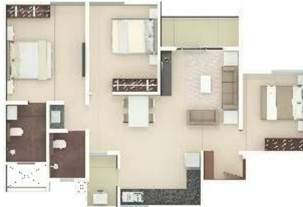
Typical 3 BHK

Carpet Area: 710 - 750 sq ft Super Builtup Area: 1050 - 1280 sq ft