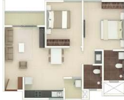
Typical 2 BHK (Type-2)

Carpet Area: 620 - 650 sq ft Super Builtup Area: 940 - 1200 sq ft