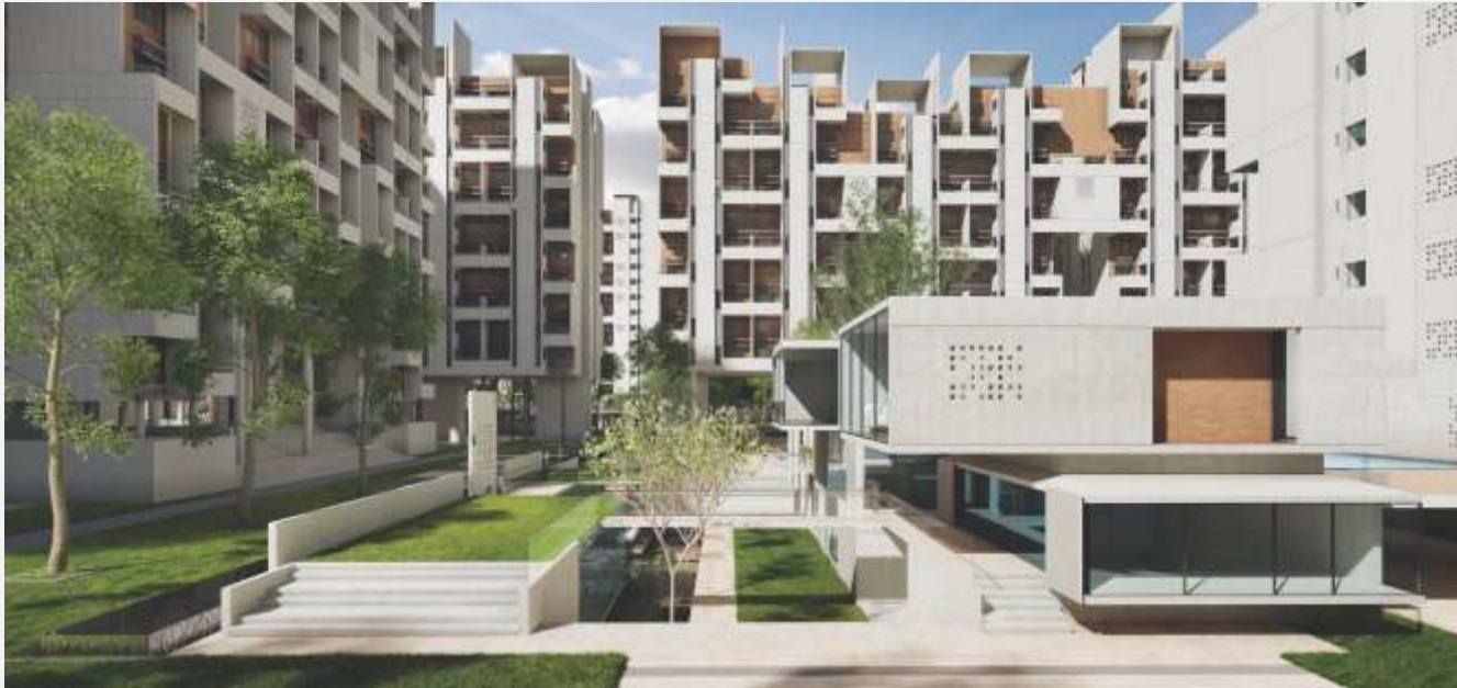
ROHAN ABHILASHA, PUNE Seamless Life in Smartly Designed Homes