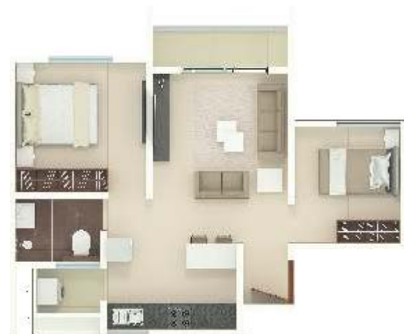
Typical 1.5 BHK

Carpet Area: 400 - 430 sq ft Super Builtup Area: 610 - 740 sq ft