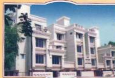
Cozy Retreat, Pune.