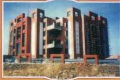
Geometric Software Solutions Company Limited, Hinjawadi.