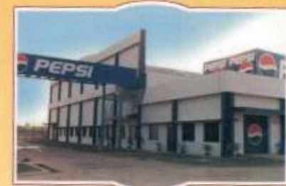
PepsiCo India Holdings Limited, Bangalore.