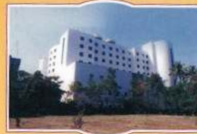
Ruby Hall Clinic, Pune.

The total construction executed is over 40,00,000 sq. ft.