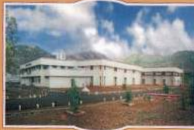
Boehringer Mannheim (India) Limited, Mahad.